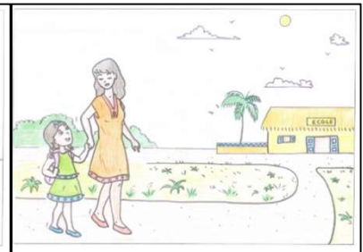
Aniyawamo kinisan omepatopo wa tisano malo.